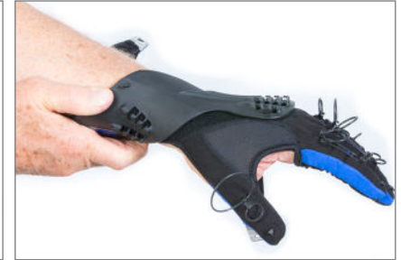
Fig 29. Apply the wrist splint up the forearm as high as possible