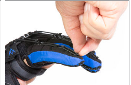
Fig. 32 Reattach DIP Tensioner for all fingers