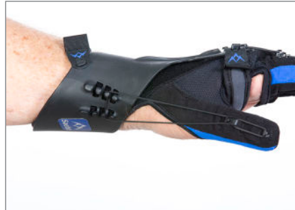
Fig. 16 Apply 1 Tensioner around both Thumb Attachment Sites

Because the thumb allows for multi-planar motion, various strategies may be required in order to position it correctly. Although, most clients will only require 1 Tensioner to be attached to the Thumb Attachment Site, consider the following if needed: