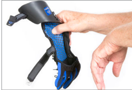
Fig. 27 Position the SaeboGlove in front of the affected hand