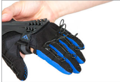
Fig. 23. Detach MCP Tensioner