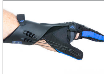
Fig. 17 Apply 1 Tensioner each around both Thumb Attachment Sites