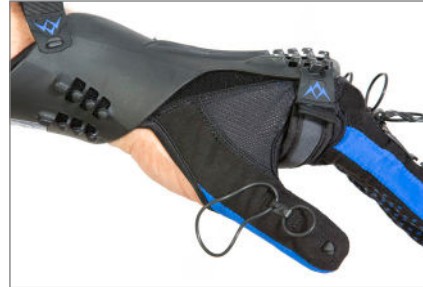
Fig. 24 Detach Thumb MCP & IP Tensioner