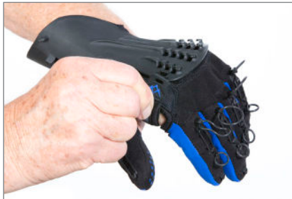
Fig. 25 Detach Forearm & Hand Straps