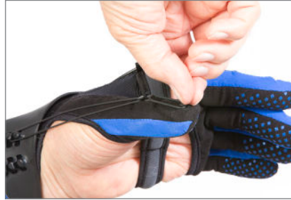
Fig. 34 Attach Thumb IP Tensioner