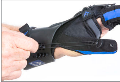
Fig. 33 Attach Thumb MCP Tensioner