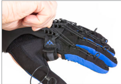
Fig. 31 Reattach MCP Tensioner for all fingers