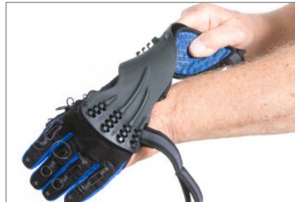
Fig. 26 Remove the SaeboGlove

Note 1: By detaching the DIP & MCP Tensioners, the SaeboGlove can be reapplied with greater ease.