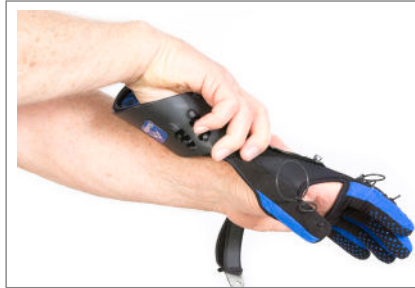
Fig. 28 Slide fingers and thumb into the appropriate sleeves