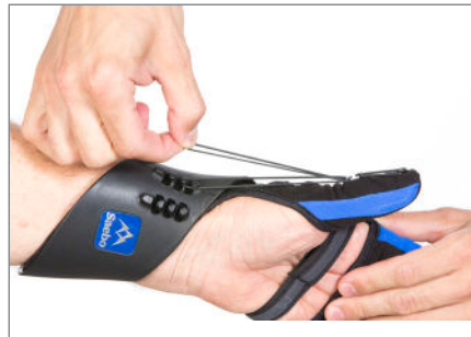
Fig. 18 Apply 2 Tensioners around the same Thumb Attachment Site