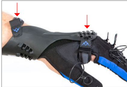
Fig. 30 Attach forearm & hand straps