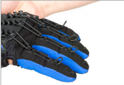
Fig. 22 Detach DIP Tensioner